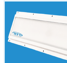
Industry-leading LED lighting with 5-year warranty