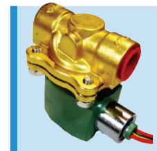
Air solenoid valve