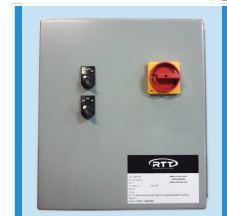
Optional UL & ETL listed control panel